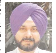
Sidhu MP from Amritsar from 2004 till 2014 was asked to step down and let party leader Arun Jaitley to contest from his seat during the 2014 Lok Sabha elections, that he was ready to bear any gain or loss for Punjab. Notably, Jaitley had lost the elections to Congress' Captain Amrinder Singh.