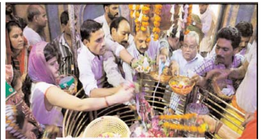
Devotees offer prayer to God Shiva during the first Monday of the Hindu month of Shravan Lucknow.