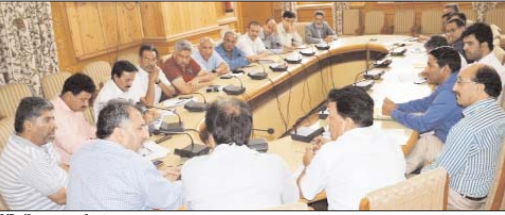
NL Correspondent Srinagar, Jul 25