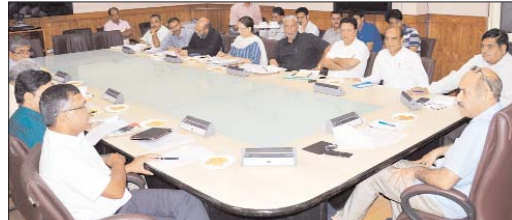
NL Correspondent Srinagar, Jul 25

Minister for Revenue Relief & Rehabilitation, Syed Basharat Bukhari today called for timely completion of World Bank funded flood restoration and management projects in the State.