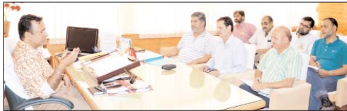
NL Correspondent Srinagar, Jul 25

The meeting was attended by Deputy Commissioner, Srinagar, Director, School Education, Kashmir, Director, CAPD, Kashmir and officers of PDD, PHE, I&FC, ERA.