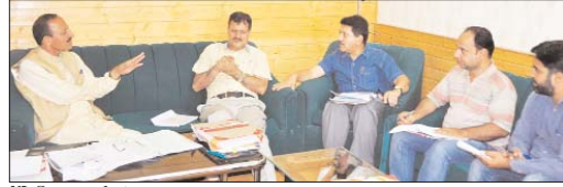
NL Correspondent Srinagar, Jul 25

Rs 1601 cr approved by Gol for the scheme