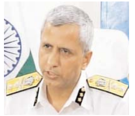
Indian Navy. The Indian Air Force aircraft AN-32 had disappeared on Friday with 29 people on board. The government has launched "Operation Talash" to locate it.

"We have not located any debris till now, search is continuing," he added. This is the fourth day of search operations conducted by the coast guard, IAF and the